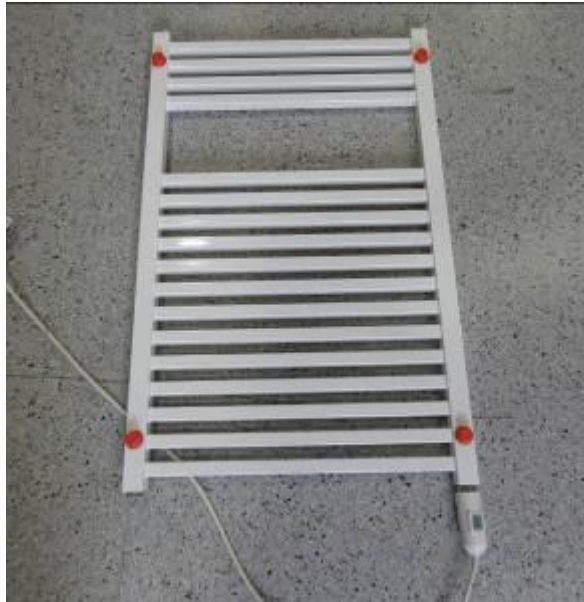
Photo 1. Barbados 500x800mm