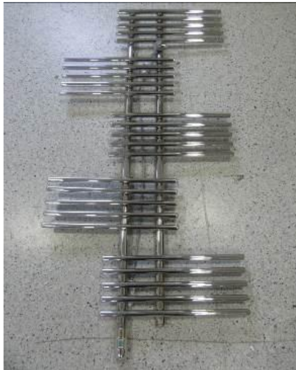
Photo 2. Fiji 650x1250mm