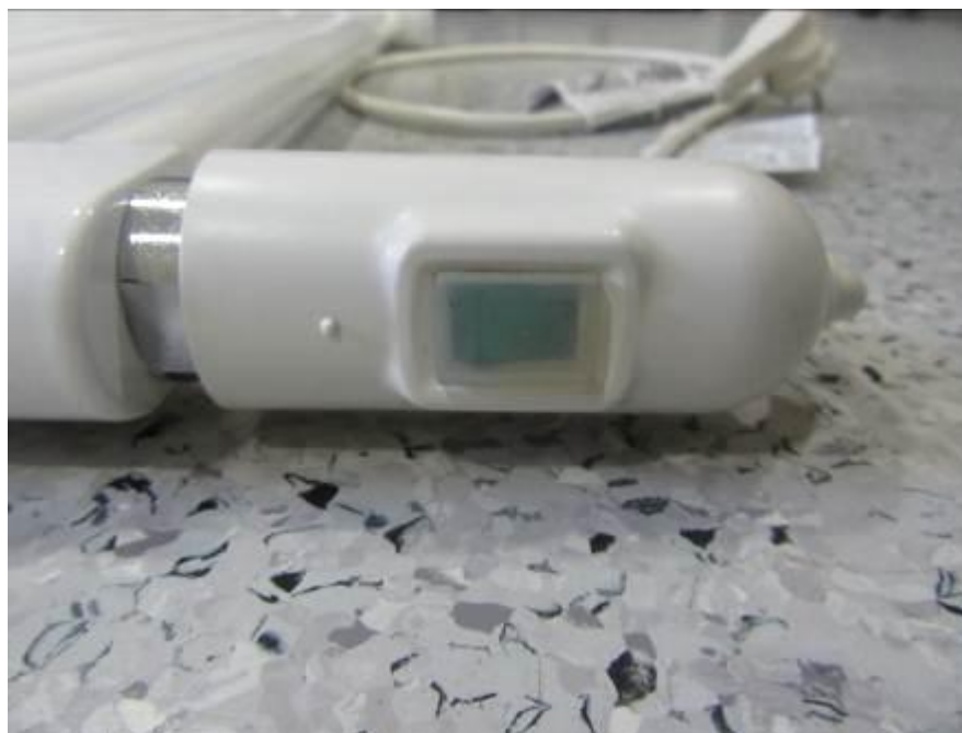
Photo 6. On-off switch