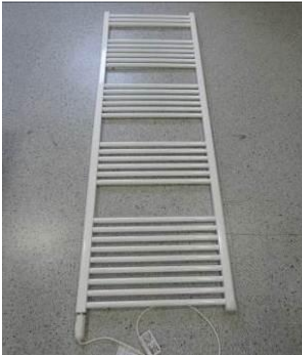
Photo 4. Haiti 600x1800mm