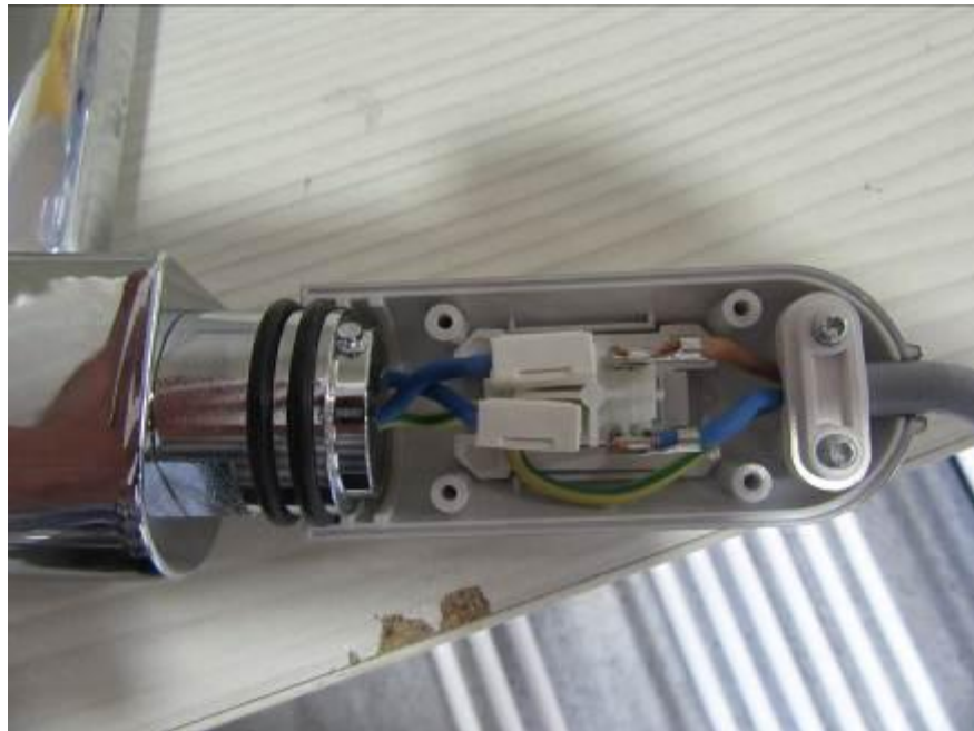
Photo 5. Inside of appliance